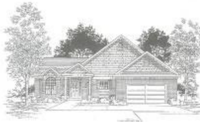
UPGRADED: STRAIGHT-ON VIEW, with more detail Additional $150.00