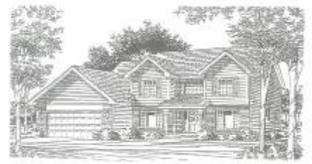
UPGRADE: PERSPECTIVE VIEW, detailed & side view Additional $195.00

RENDERING DRAWING – must be received by February 3, 2012 - failure to provide rendering information may result in additional charges or no illustration shown in guide.