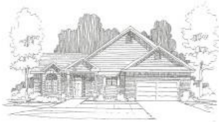
STANDARD HOME ILLUSTRATION Included in Entry Fee

The following are examples you can request when with your contract with the necessary blueprints/photos before FEBRUARY 3, 2012. This will also serve as a guideline for the type of renderings that will be printed if supplying